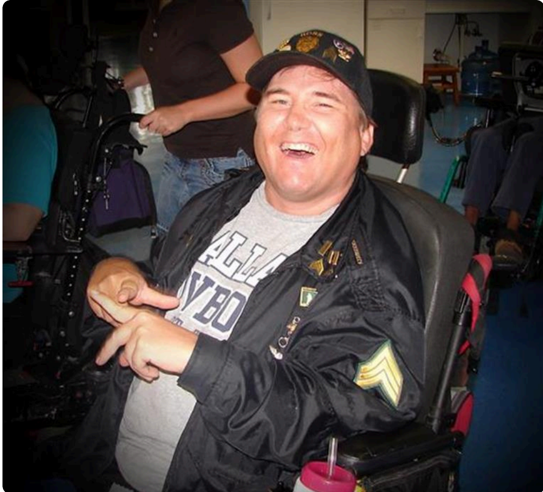
What a Beautiful Smile